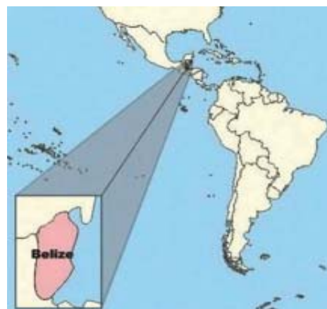
Belize is easily accessible by air for both freight and travel.