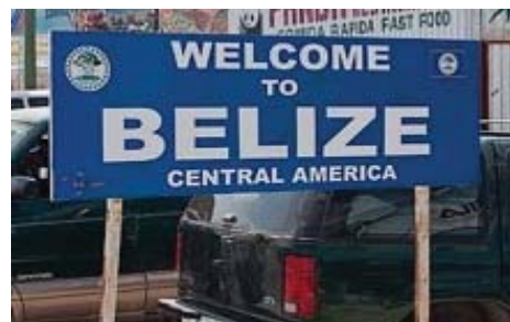
Belize has a stable government and welcomes foreign visitors. Urban areas have good water but most rural areas have no public water systems at all.

D6110 Chair of Water and Health Concerns, is leading this effort. The District 6110 Water & Health Committee has worked for two years developing an international project that partners with Rotary and Interact clubs in Belize. We have $30,000 district designated funds available from District 6110 for these projects.